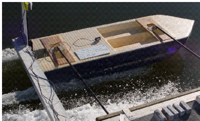
M Ship's Proprietary REI Hull Testing Program

Hull models are accurately fabricated using N/C-milled rapid prototyping techniques and evaluated on a self-powered, open-water tow testing platform that provides real-time force, trim, and acceleration measurements along with realistic flow visualization.